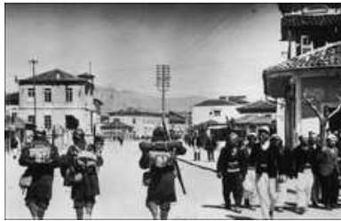
Three Albanian soldiers in an unidentified location fleeing North with peasants towards Yugoslavia