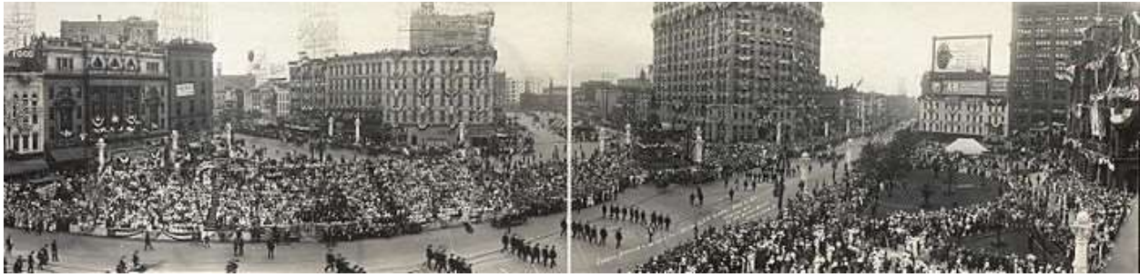
GAR Parade during the 1914 Encampment in Detroit, Michigan