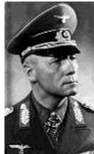
Australian troops (left) occupy a front line position at Tobruk. Field Marshal Erwin Rommel in 1942