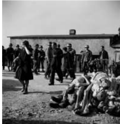
German civilians are forced by American troops to bear witness to Nazi atrocities at Buchenwald concentration camp, mere miles from their own homes, April 1945.