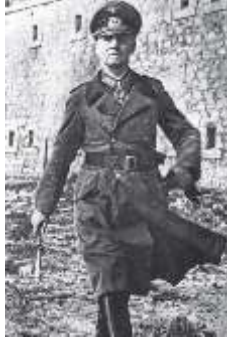
German general Erwin Rommel arrival in the desert in early 1941