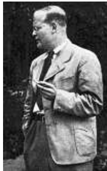
Bonhoeffer in 1939