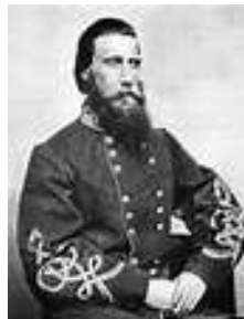
General John Bell Hood