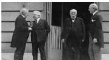
Leaders of the victorious Allied powers—France, Great Britain, the United States and Italy