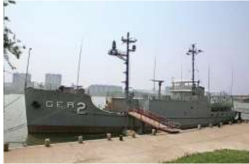
USS Pueblo (AGER-2) – Pyongyang