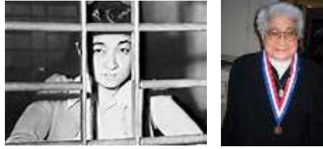
Iva Toguri aka Tokjo Rose