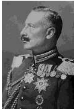
Kaiser Wilhelm II, c. 1914