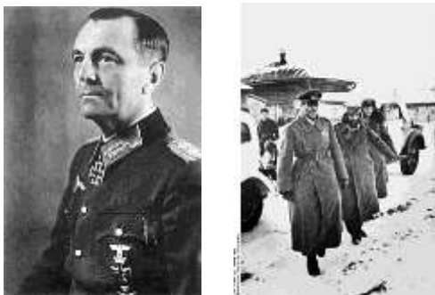
Paulus (left) and his aides Col. Wilhelm Adam (right) and Lt.-Gen. Arthur Schmidt (middle), after their surrender in Stalingrad