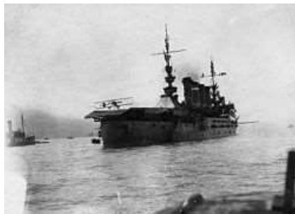
First fixed-wing aircraft landing on a warship