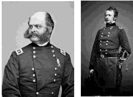
General Ambrose Burnside (left) and General Joseph Hooker