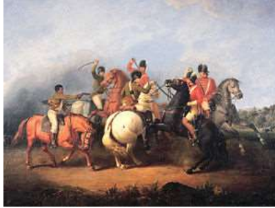
This depiction of the Battle of Cowpens shows an unnamed black soldier (left) firing his pistol and saving the life of Colonel William Washington