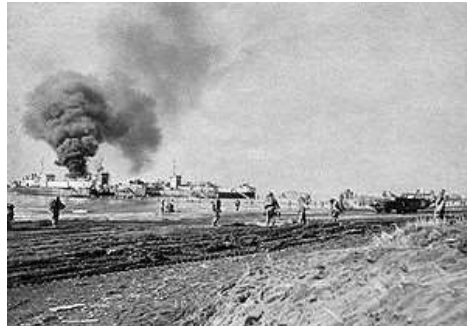
U.S. Army soldiers landing at Anzio in late January 1944.