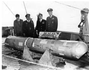
The B28RI nuclear bomb, recovered from 2,850 feet (870 m) of water, on the deck of the USS Petrel.