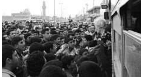
Human shields greeted as they cross the border into Iraq, 15 February 2003