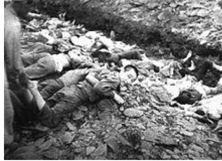
Prisoners lie on the ground before execution by South Korean troops