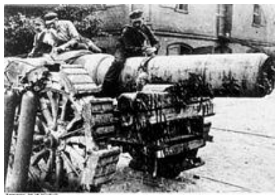
Cover of the English version and workmen decommissioning a heavy gun, to comply with the treaty.