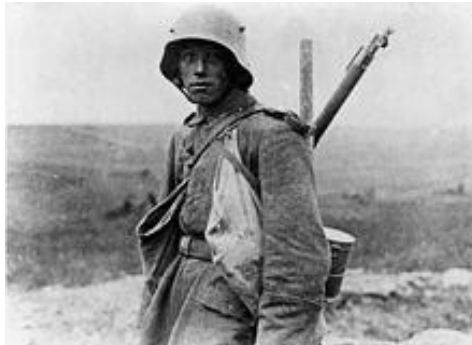
A young German Sommekämpfer in 1916