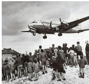
Berliners watch a C-54 Skymaster land at Tempelhof Airport, 1948