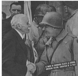
The mayor of Cherbourg thanks General Collins for liberating the city