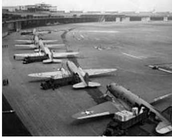
C-47 Skytrains unloading at Tempelhof Airport during the Berlin Airlift.