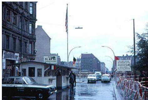
A view of Checkpoint Charlie in 1963, from the American sector