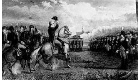
George Washington taking command of the Army.