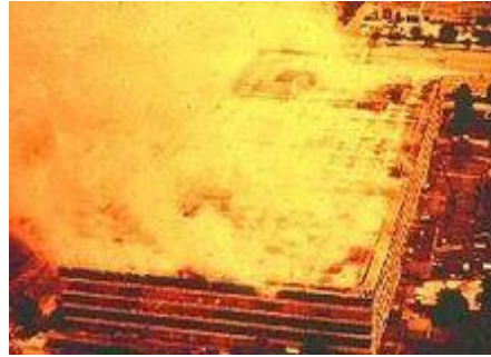
Conflagration underway, 1973