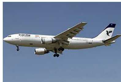
USS Vincennes and a similar A300B2-200