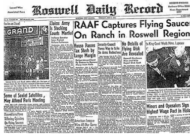
Roswell Daily Record announcing the "capture" of a "flying saucer."