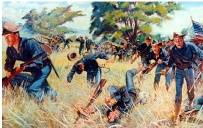
Gatling guns hauled by mules arrive to turn the tide at San Juan Hill