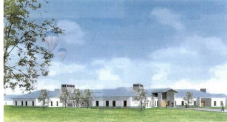
Ardie R Copas State Veterans Nursing Home Concept