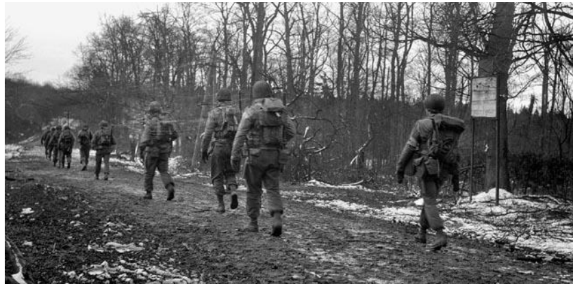
Soldiers of the 2nd Ranger Battalion slog their way along a muddy road on their way to Hill 400, the scene of a fierce stand against repeated German attacks.

He appealed to V Corps for assistance, specifically for the 2nd Ranger Battalion, which was nearby but under V Corps control.