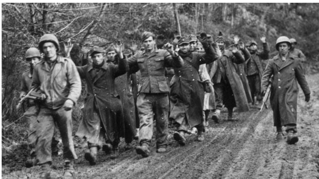
American soldiers escort a group of Germans captured during the battle to a POW cage somewhere behind the lines.