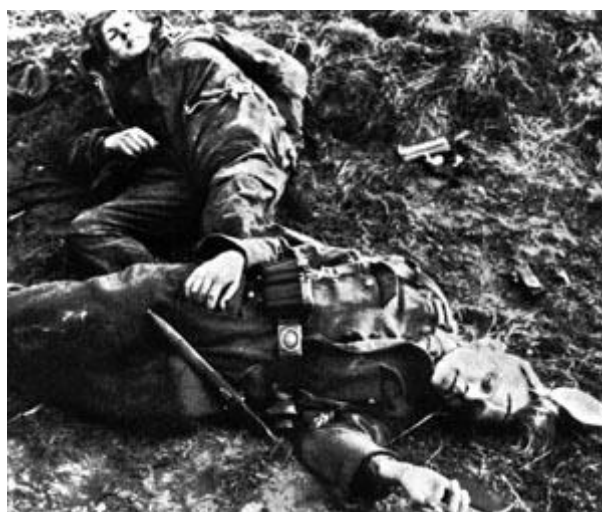
Young German defenders lie dead in the Hurtgen Forest. German casualty figures are hard to come by, but at least 28,000 Germans were killed, wounded, captured, or went missing.