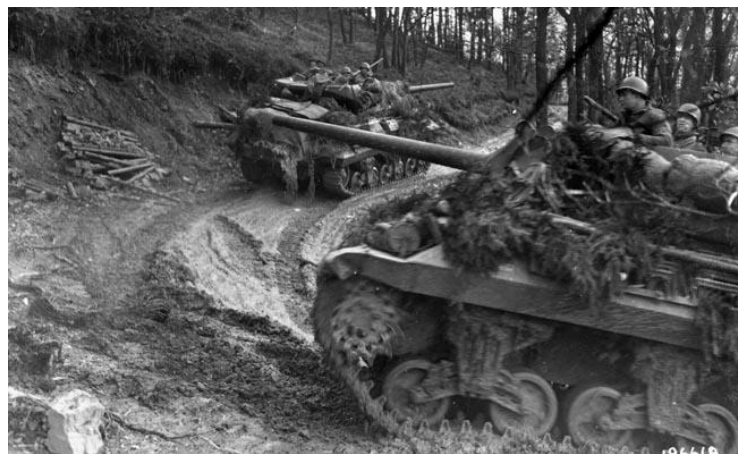
American M-10 tank destroyers crawl up a muddy road through the forest. The narrow, twisting roads and thick stands of trees made the use of armor all but impossible.

Although one company of the 121st Infantry had reached the edge of the forest, the Germans still held several hundred yards of the woodline east of the highway. This was a logical hiding place for antitank guns. These would be deadly for the tankers. Further, since the Germans still covered the road, American combat engineers could not sweep it for mines, including antitank mines. Finally, there was a large bomb crater near the southern edge of the woods that would have to be bridged before the tanks could begin to roll down the highway.